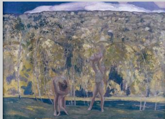
Rockwell Kent, Nude Family in Landscape, Newfoundland , c 1914-1915, Oil on canvas, 71.2 x 96.8 cm, Purchased with the assistance of a Movable Cultural Property grant accorded by the Department of Canadian Heritage under the terms of the Cultural Property Export and Import Act and with funds provided the Art Sales and Rental Society, Halifax, Nova Scotia, 2008